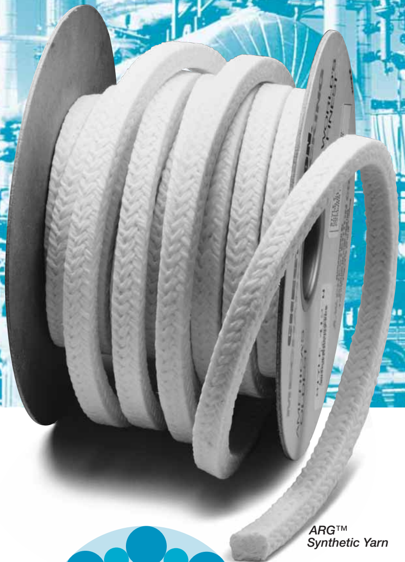
ARG™ Synthetic Yarn

CHESTERTON® 412-W is designed for shafts and rods against water, oil, steam, solvents, and mild acids and alkalis to 450°F (250°C) and shaft speed to 2,000 ft/min (10 m/sec), pH 4 –10.